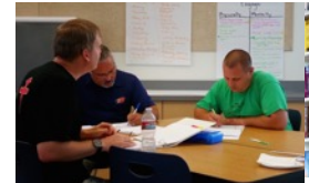
EXPANDING SCHOOL CAPACITY FOR STEM TEACHING-LEARNING