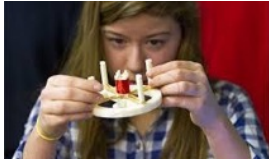
GETTING MIDDLE SCHOOL STUDENTS EXCITED ABOUT CTE