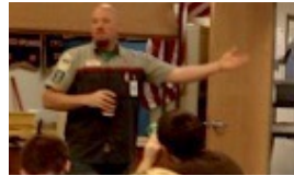
ADDING RELEVANCE TO LEARNING WITH PARTNERSHIPS